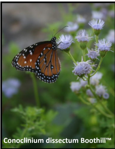
Conoclinium dissectum Boothill™

For many years, there has been a growing interest in gardening for butterflies, especially with the focus on providing habitat and food sources for Monarch butterflies, one of our most notable pollinators. There are many great resources out there to help you plan your garden for becoming a haven for butterflies. Two great resources we used to compile this list are the booklet “Desert Butterfly Gardening” published by the Arizona Native Plant Society and the Sonoran Arthropod Studies Institute, and Native Gardens for Dry Climates by Sally and Andy Wasowski. We also received some great observations and notes from Tucson horticulturalist Greg Starr. More great resources for butterfly attractors in your region can also be found at your local botanical gardens, such as the Desert Botanical Garden, Tucson Botanical Garden, and Tohono Chul Park here in Arizona. Local independent retail nurseries are also a great source of information on plants that will thrive in your climate.