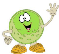
RCSCW Green Team

"In 1997, Tiger Woods shot a Masters record 70-66-65-69-270. His 18-under-par total was one stroke better than previous record holders Jack Nicklaus (1965) and Raymond Floyd (1976). He also became the youngest Masters champion at 21 years, three months, 15 days. Wood's 12-stroke margin of victory was the largest in tournament history."